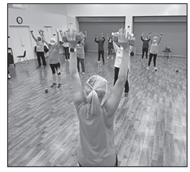
It's always a wonderful day to attend programs at BA Seniors. The first class of the Center's all new Strengthen & Tone class was well attended! Come join us on Tuesday and Thursday at 8:15 a.m.