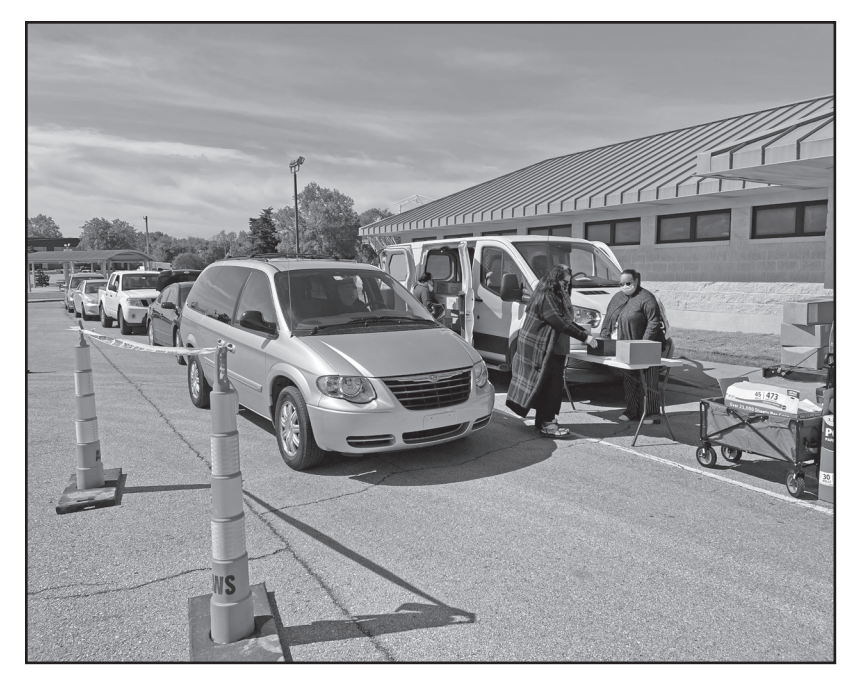
A beautiful spring day set the perfect stage for the nutrition program to move temporarily to the Family Aquatic Center on Main Street. Food was distributed there for just one day because of construction work on the new Senior Center East Annex in the Center's parking lot.