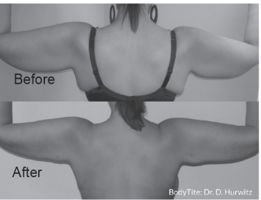
Safe, gentle, effective minimally invasive procedures for the face & neck and body contouring