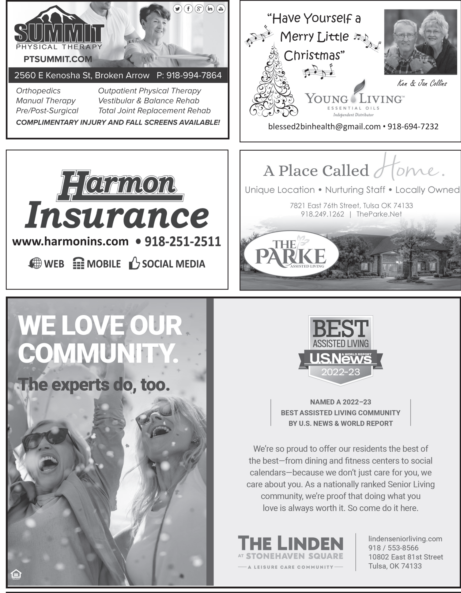
Page 16 • Silver Notes • Broken Arrow Seniors • December 2022